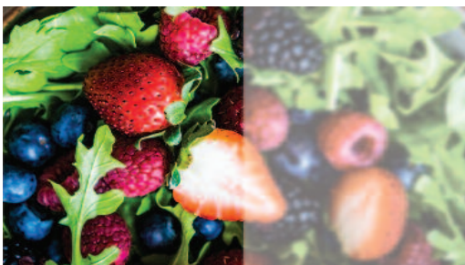
Viewed through material with low haze